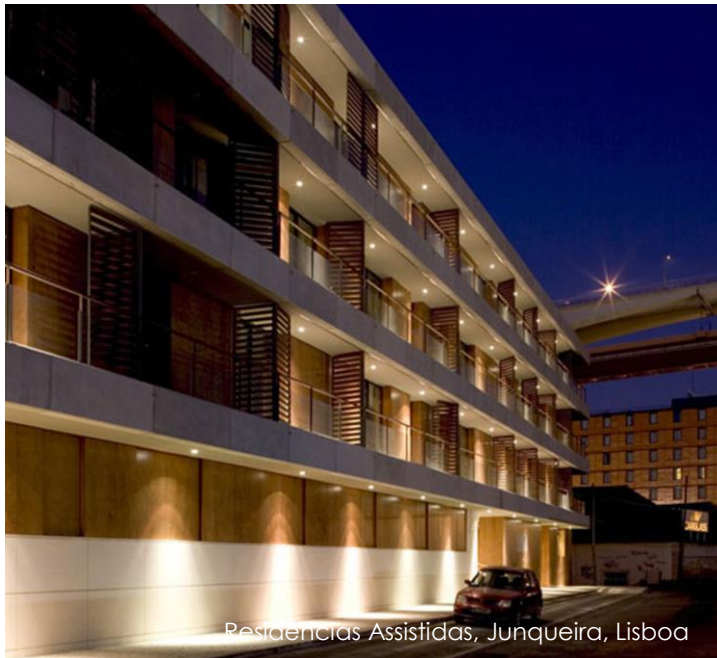
Residências Assistidas, Junqueira, Lisboa

You can find below our engineering specialties.