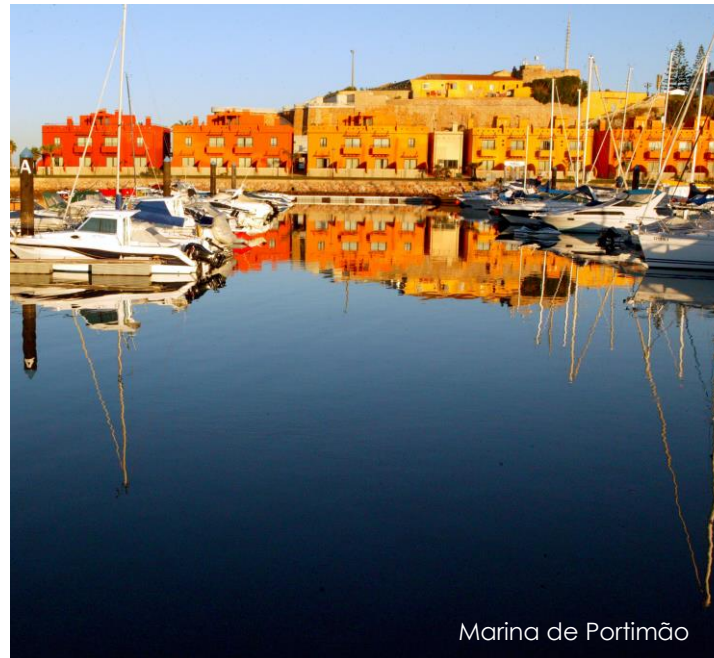
Marina de Portimão